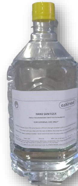
Ashirvad sanitizers are now in production to keep our Corona Warriors safe

Our team will call them back asap, with financial/health assistance.