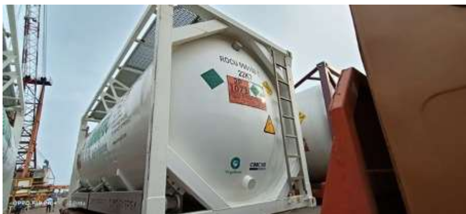
Photo 2. Medical relief from Kuwait on-board INS Tabar comprising of 2 ISO Oxygen tanks containing 40 metric tonnes of Liquid Medical Oxygen and 600 Oxygen Cylinders, docked at New Mangalore port yesterday for further distribution to various States.