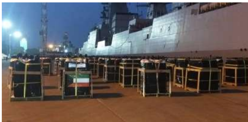
in Photo 1. Medical Relief from Kuwait on-board INS Kochi comprising of 3 ISO tanks containing 60 metric tonnes of Liquid Medical Oxygen, 800 Oxygen Cylinders and 2 high-flow Oxygen Concentrators docked at New Mangalore Port yesterday for distribution to various States.