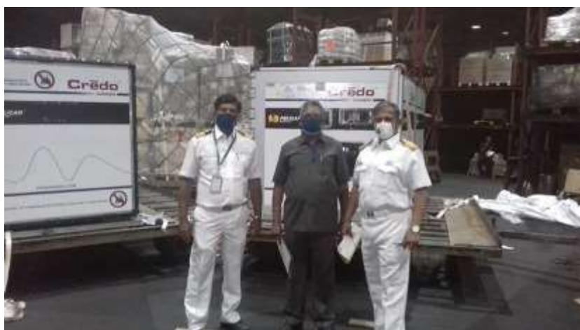
Photo 3. 78,595 vials of Remdesivir from the United States of America landed at Mumbai Airport last night. The vials are being distributed to various States.